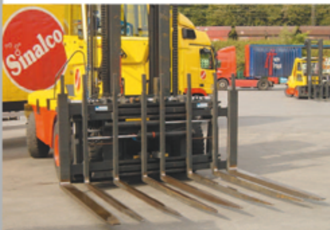
Multi Pallet Handler for 4 or 8 Pallets 12 T 419 4-8