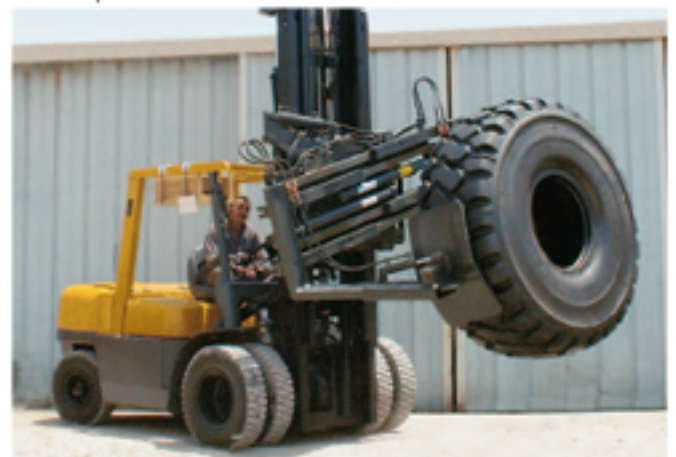
Tyre Handler T 421