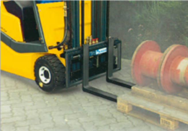
Sideshifter 2 T 151 P4