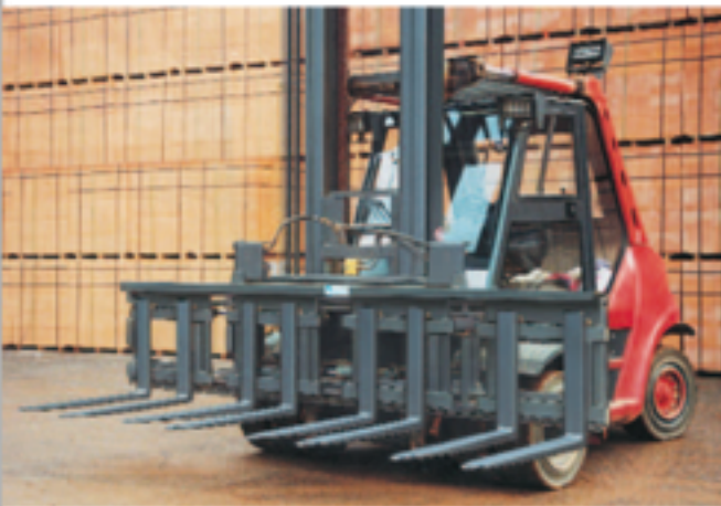
Quadruple Sideshifter T 254