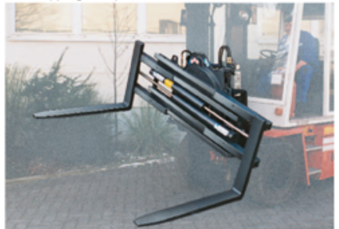
Rotating Fork Clamp 4 T 451