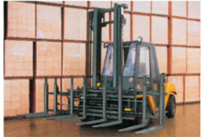
Quadruple Pallet Handler 6 T 419-2-4