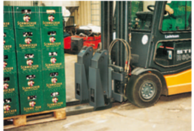
Pusher Fork 2 T 140