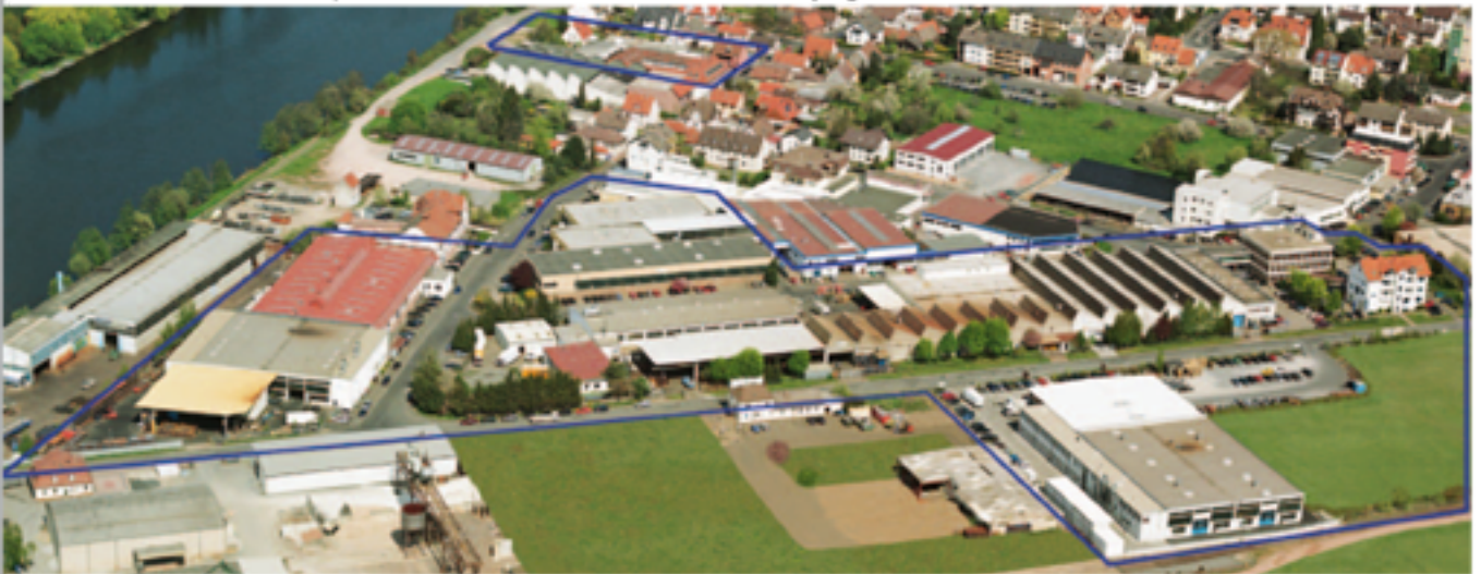
Arial view KAUP Factory May 2004