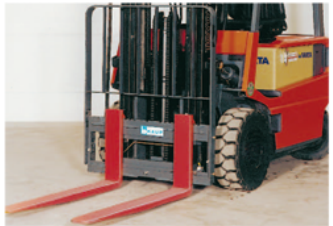
Integrated Sideshifter 1,5 T 151 I