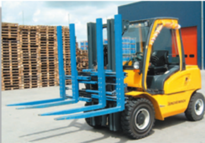
Double Pallet Handler 3 T 429-2