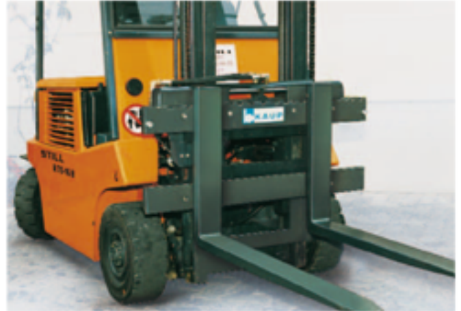
Sideshifter 2 T 151 P2