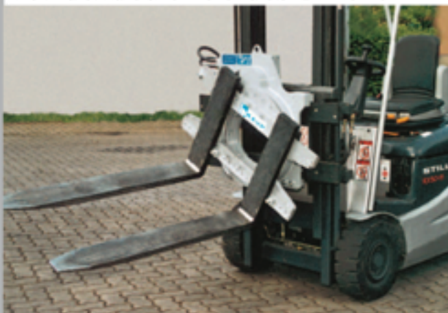
Rotator 2,5 T 351.3 ES, Fishery Version