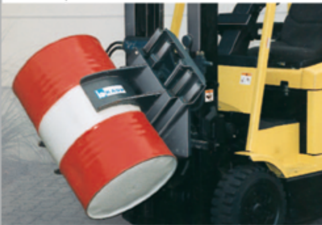
Drum Clamp 1,5 T 415