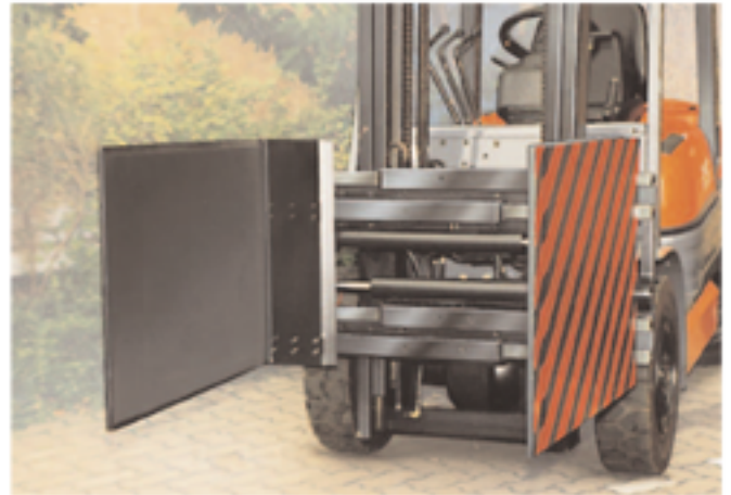
Appliance Clamp 1,5 T 413 G