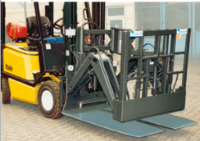
Push-Pull with Pallet Recuperator 2 T 145