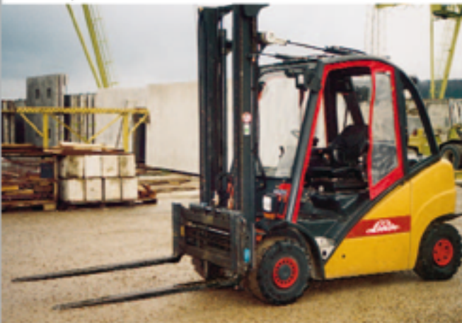
Fork Positioner 2 T 163