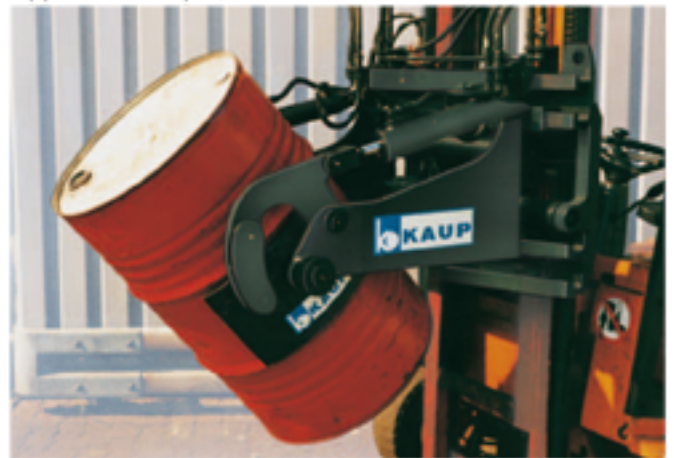
Drum Tippling Clamp 1,5 T 406 2 H