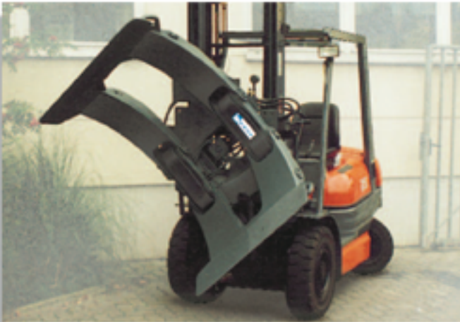
Rotating Roll Clamp 3 T 458