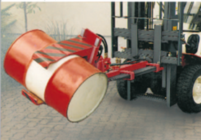
Mini Drum Clamp 0,3 T 445 F