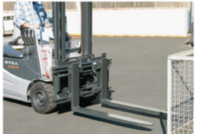
2 T 466