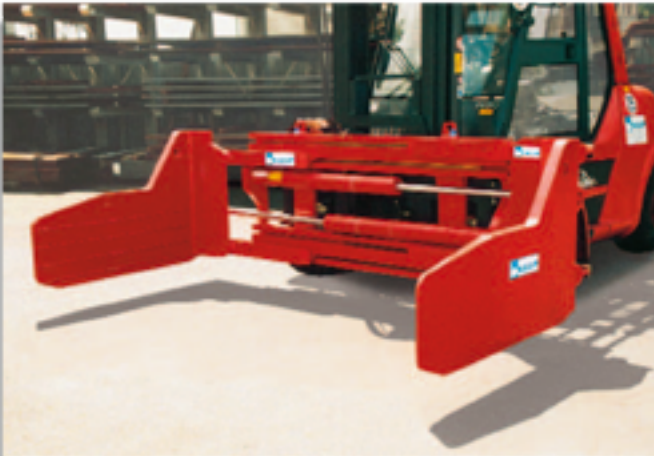
Bale Clamp 8 T 413