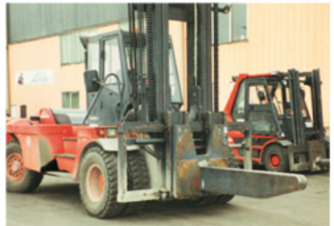
Carrying Ram 25 T 185